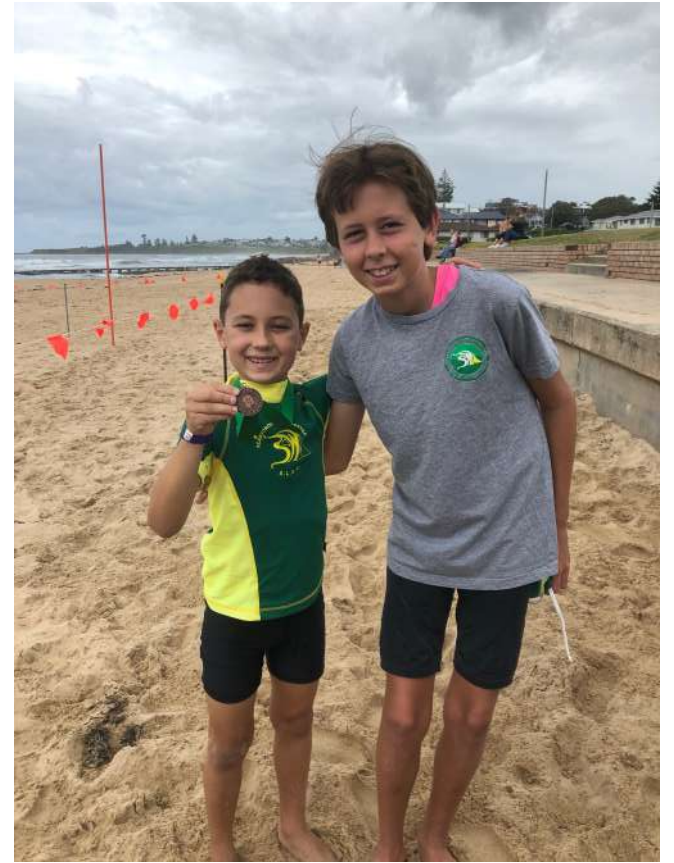
SWSLSC members competing in 2021-2022 Surf Lifesaving Illawarra Junior Branch Championships