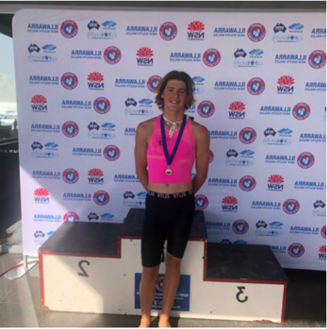
SWSLSC members competing in junior and senior Surf Lifesaving Illawarra events throughout season 2020-2021.