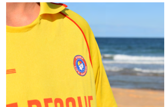
SWSLSC members bringing down the flags on the last day of the 2020-2021 season.